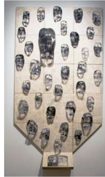
Pamina Traylor (American, born 1964), Tagged , glass and mixed-media, 2001–2004. Museum Purchase, World Art Fund, 2008.1

This extraordinary work required three years to complete and is a meditation on the nature of ethnic prejudice. Images are photo transferred onto solid-sculpted glass “tongues.” The majority of the photographs are altered reproductions of photos by Dorothea Lange, taken for the War Relocation Authority during the period that Japanese Americans were forcibly relocated to internment camps. The “book” shows a family photograph from the Topaz Internment Camp, with the artist’s mother shown as a young girl seated at the right. The newspaper clippings, primarily from The New York Times , are about recent ethnic prejudice directed against Arab Americans. All the clippings are from September 11, 2001 to 2004, when the work was completed. Tagged is being presented as part of the on-going Dialogues program in conjunction with The Art of Gaman .