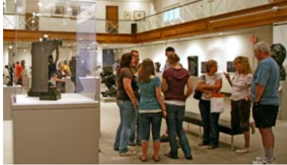
United States Senator Chris Dodd and his family visit the Rodin exhibition during UConn's Family Weekend in October 2007.

The museum has been a very busy place. Last semester, with Rodin: A Magnificent Obsession , Sculpture from the Iris and B. Gerald Cantor Foundation , we saw record crowds in our galleries. Rodin's sculpture, such an important and well-known celebration of artistic accomplishment, provided a springboard to discussion about creativity, authenticity, authority, ambition, and fame. The response of public school groups, university classes and members of our surrounding communities was heartwarming indeed.