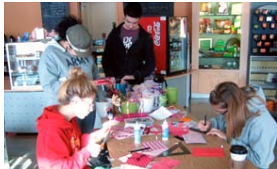
Make It/Take It 2007

Lunar year 4705–4706 begins on February 7. Come hang your New Year's wish on our Wish Tree and make it come true with a donation.