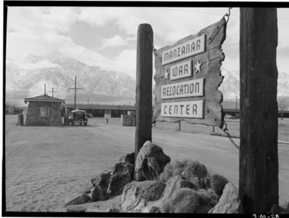
Entrance to Manzanar, Manzanar Relocation Center, California.

In 1943, distinguished American photographer Ansel Adams (1902-1984) captured through his lens the individuals, daily life, work, and pastimes in the Manzanar War Relocation Center, located at the eastern edge of the Sierra Nevada mountains, approximately two hundred miles northeast of Los Angeles. Of his photos, Adams wrote when he offered the collection to the Library of Congress in 1965, “The purpose of my work was to show how these people, suffering under a great injustice, and loss of property, businesses and professions, had